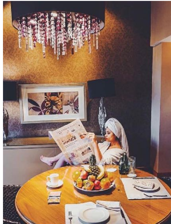
Club InterContinental Rooms and Suites