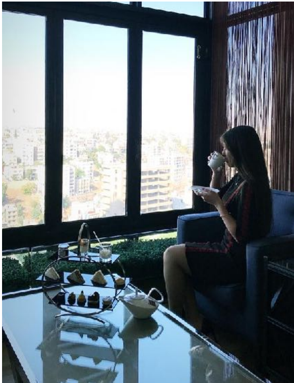
Personalised service delivered by a dedicated Club InterContinental Team