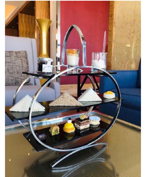
Curated Culinary Experiences