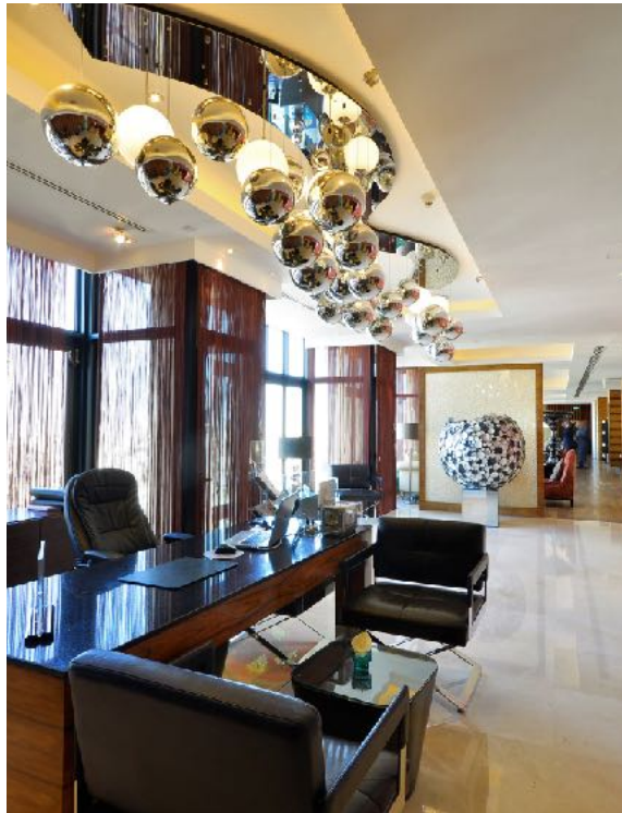
Exclusive Club InterContinental Lounge